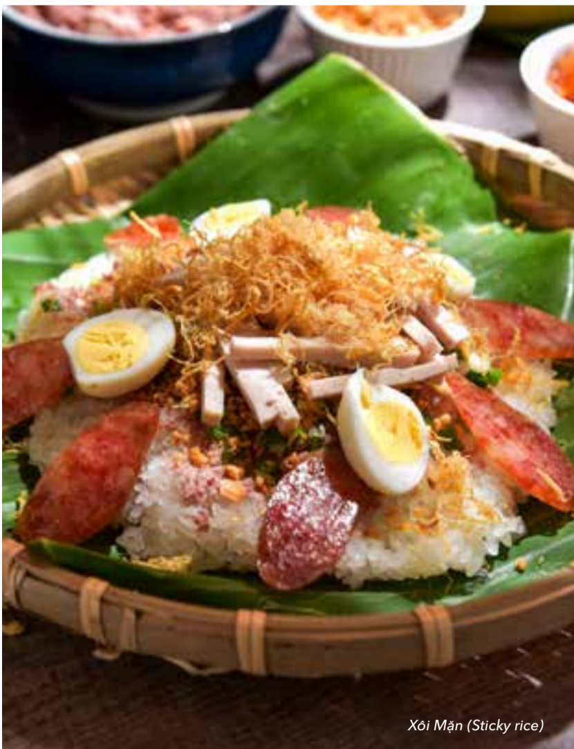
Xôi Mặn (Sticky rice)

Saigon, with its bustling streets and lively atmosphere, is renowned for its vibrant street food culture. For those seeking an authentic culinary adventure, there's no better way to experience the city's rich flavors than through a thrilling street food tour by motorbike.