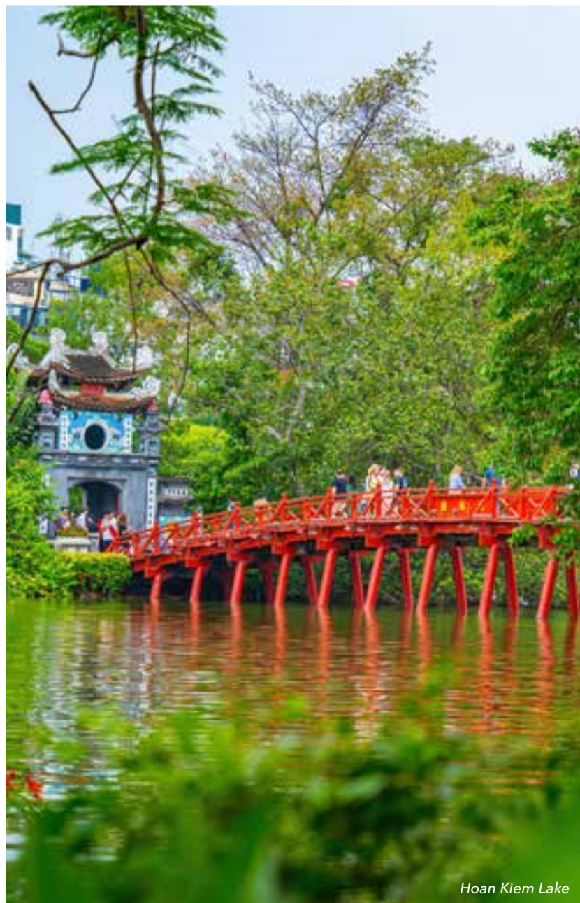
Hoan Kiem Lake

of discovery. Whether you're savoring the flavors of Vietnamese cuisine, exploring hidden alleyways, or immersing yourself in ancient traditions, a summer visit to Hanoi promises a truly unforgettable experience.