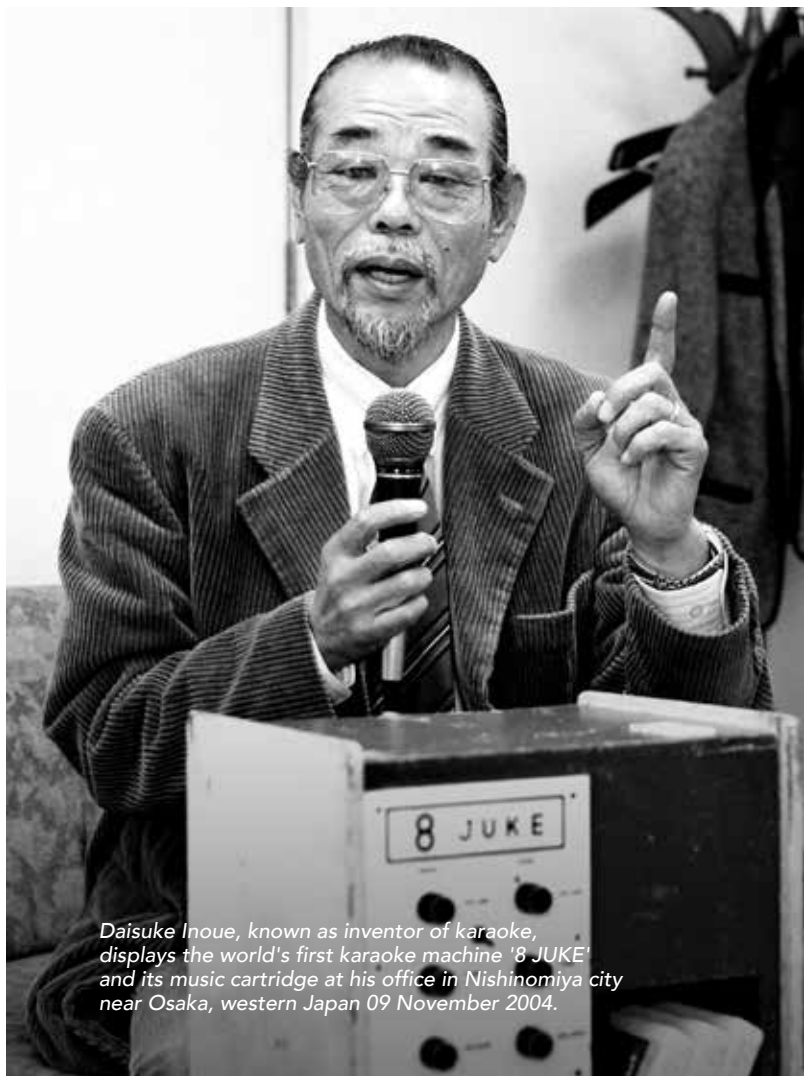
Daisuke Inoue, known as inventor of karaoke, displays the world's first karaoke machine '8 JUKE' and its music cartridge at his office in Nishinomiya city near Osaka, western Japan 09 November 2004.

A well-known global word is a loan word from Japan, where this phenomenon was invented. Karaoke combines 'kara' from the Japanese word 'Karappo' meaning empty and 'oke' the short version of 'okesutora' for orchestra. The term 'empty orchestra' was conceived by a Japanese entertainment group that resorted to playing orchestral music from a machine after musicians went on strike. It is said that when they looked into the empty orchestra pit there were no musicians yet music was playing. Hence, kara okesutura (the empty orchestra) -karaoke for short.